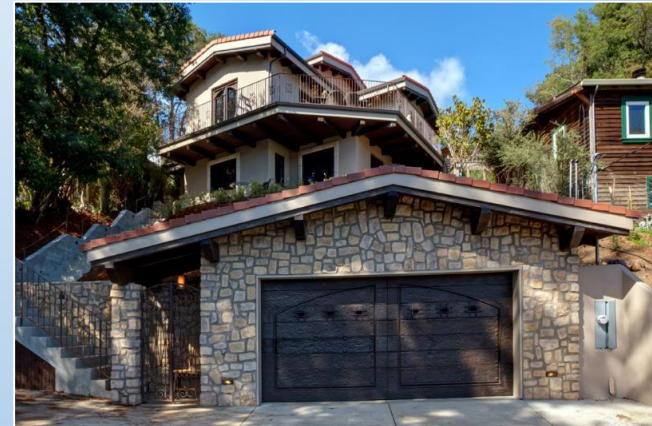
San Francisco, CA